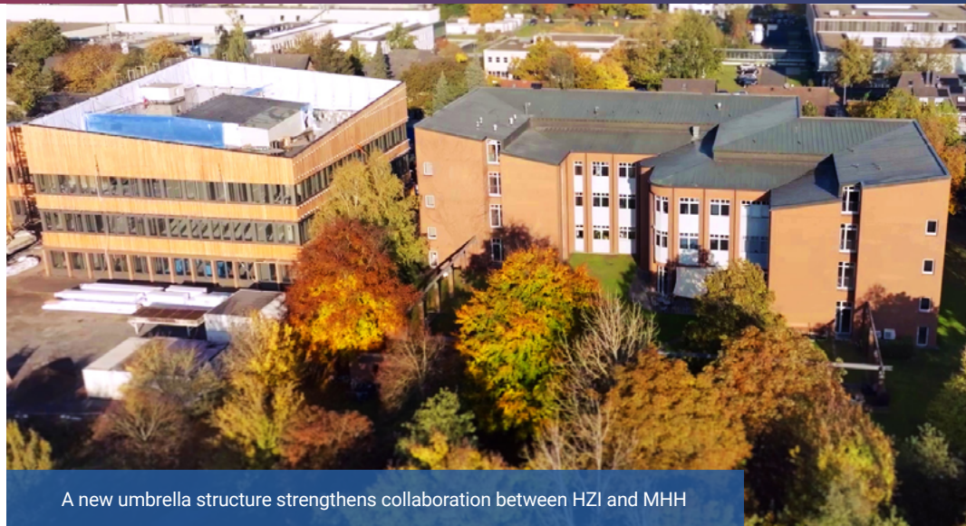
A new umbrella structure strengthens collaboration between HZI and MHH